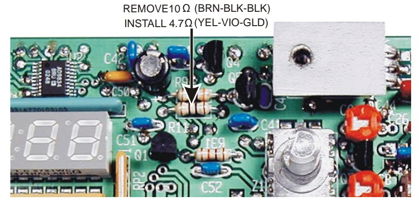
Figure 1. Replacing R11.